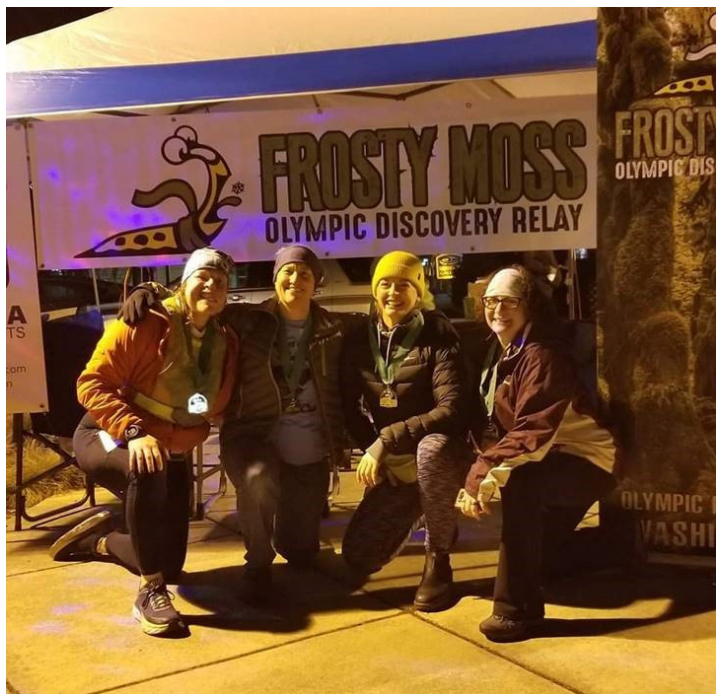
The Super Sloth Ladies' Running Club: (L-R)