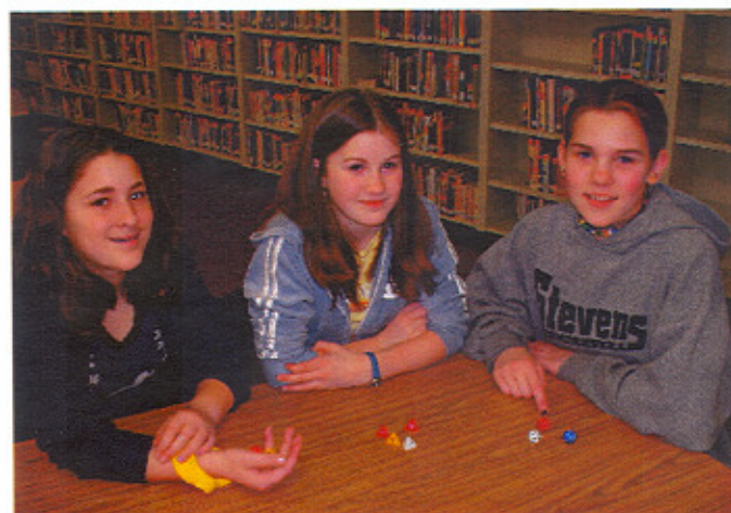
Students practice their math skills using dice.