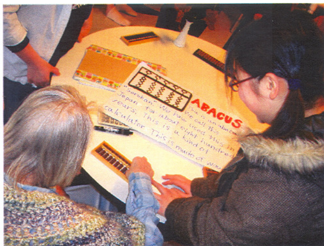
Japanese students spend the day teaching some of our senior citizens how to work an abacus.