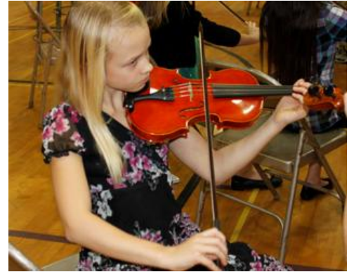
Stevens Students Show School Spirit! Pictures from last week's assembly- A Minute to Win It!