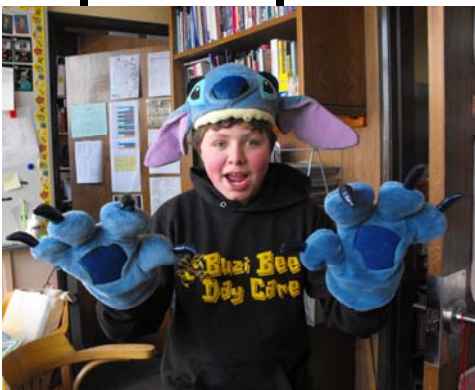
Prize Winners from the Holiday Shop!