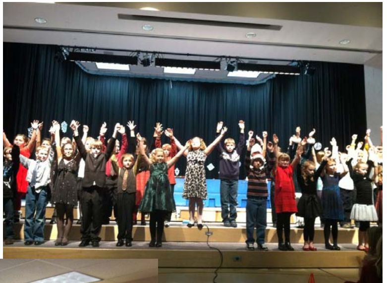
Dry Creek Performers