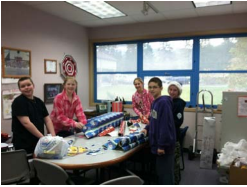
Students wrapping gifts for a Family