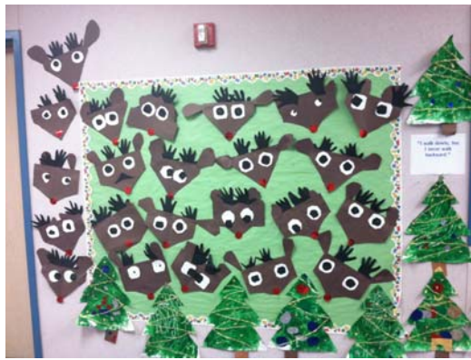
Rudolph the Red Nosed Reindeer decorates our school halls!