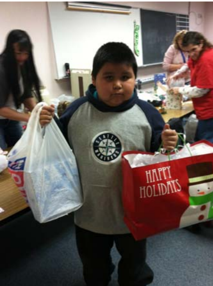
Big shopping day from the Holiday Gift Shop below.