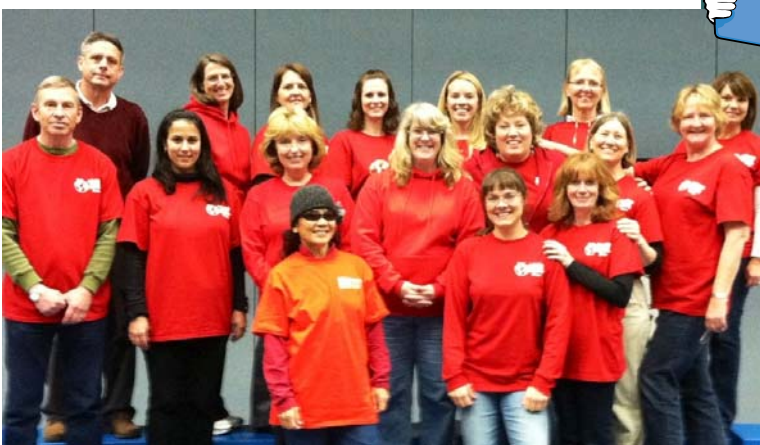
Staff wearing their red shirts in honor of PAEA (Teacher Association)